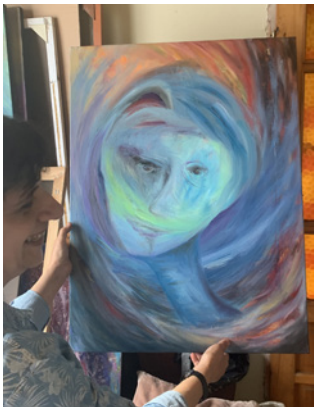
Among the Waves (2020) Oil on canvas, 80 x 60 cm