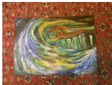
Storm & Waves (2022) Acrylic on cardboard, 50 x 70 cm