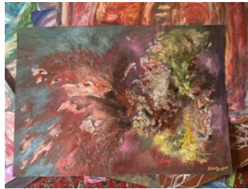
The Volcano (2013) Acrylic on paper, 48 x 68 cm