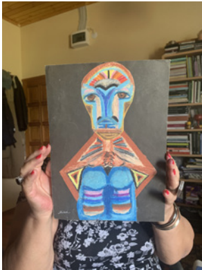
Kunta Kinte (1975) Pastel on black paper, 30 x 22 cm