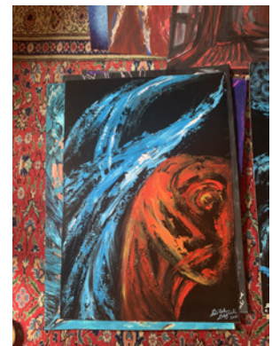
Fear (2021) Acrylic on cardboard, 70 x 50 cm

THE END OF A PERFECT DAY Dilek and I enjoy a raki toast