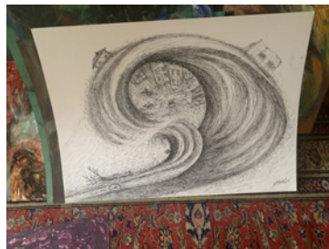
Tsunami (2020) Pen on paper, 50 x 70 cm