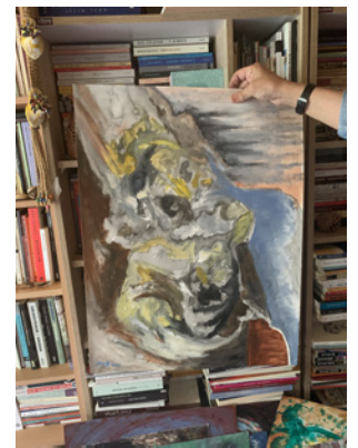
Bulldog Man (2021) Acrylic on paper, 66 x 50 cm