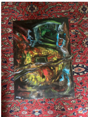
Entering a World of Passion (2021) Acrylic & ink on paper, 54.5 x 39.8 cm